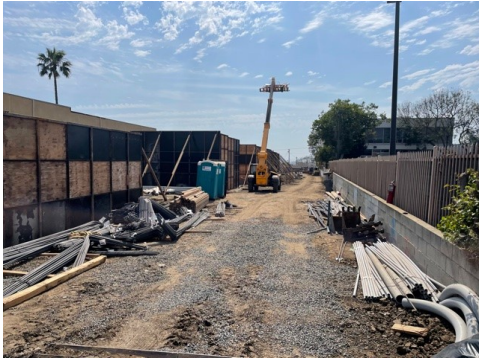
Westhaven - Los Angeles, CA