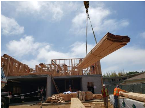
Windsor Pointe- Carlsbad, CA

Thank you to everyone involved including: Bank of America, County of Los Angeles, City of Los Angeles, Banner Bank, HCD, CCRC, CalHFA , San Diego Housing Commission, Chase Bank, City of Oakland, Alameda County, Oakland Housing Authority, AC Martin, Bank of the West, Bay Area Community Services, BKF Engineers, Boston Capital, CADC, Cahill Contractors, Carrier Johnson + Culture, CCRC, Compass FAH, Interfaith Community Services, City of Carlsbad, City of San Diego, County of San Diego, Dahlin Group, EPT Design, Form/Work, Fuscoe Engineering, HA Builder, Homeless Health Care of Los Angeles, Jett Landscape & Design, JP Morgan Chase, Kettler Leweck Engineering, Las Palmas Foundation, MJS, Nexus for Affordable Housing, PATH Ventures, Project Design Consultants, Raymond James, Redstone, St. Vincent de Paul Village, Togawa Smith Martin, US Bank, Walton Construction and WNC