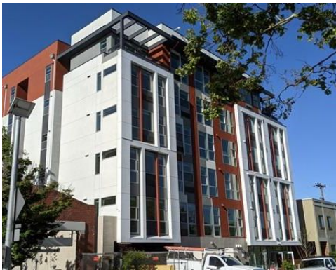
Nova - Oakland, CA

The constraints of this past year have created a lot of hardships, but it has created opportunities too. This year we will complete our first two developments in Oakland, CA serving persons experiencing homelessness. Also, we will complete our third, HHH funded, Supportive Housing community in the city of Los Angeles. And lastly, we have five new developments under construction, bringing the total number to 9 projects under construction. We are grateful and thankful to everyone involved!