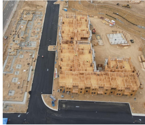
The Orchard at Hilltop - San Diego, CA