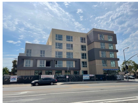
Dahlia - Los Angeles, CA