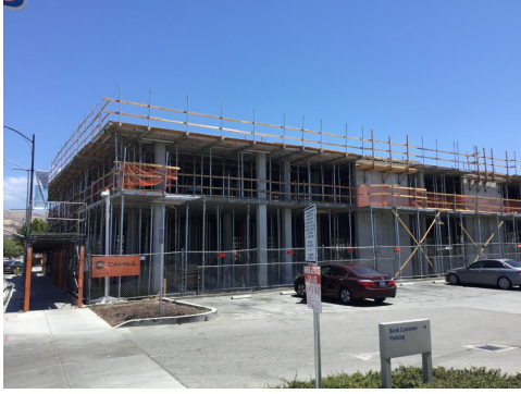
Vela - San Jose, CA