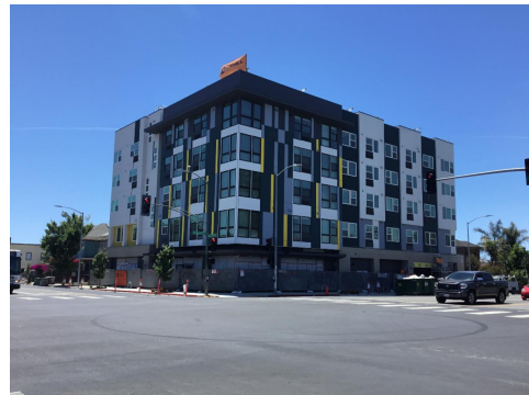
Aurora - Oakland, CA