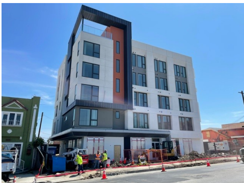
Emerson - Los Angeles, CA