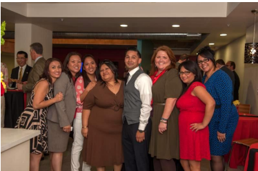
From left to right: Solari team @ Monte Vista grand opening, Auburn Park grand opening, Cassia Heights grand opening, Maple Square grand opening, Lotus Garden Grand Opening and Arbor Green grand opening