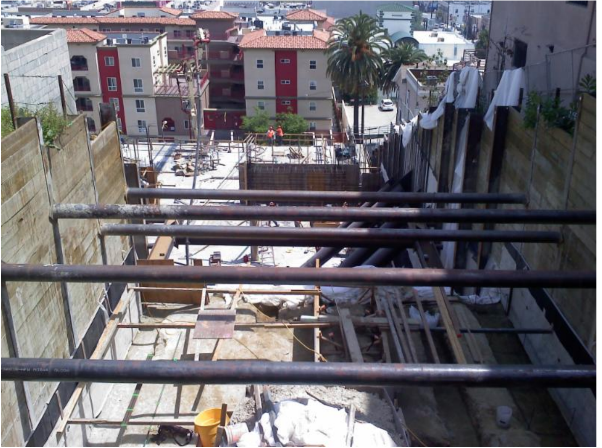
In this image you are looking down towards Yale Street- Lotus Garden fronts Yale Street