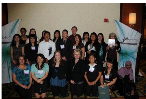
Scholarship winners pose for a picture at the AHMA-PSW awards