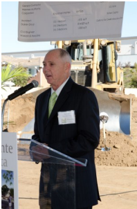
Mayor Pro Tem, Rick Gibbs

On the 9th of February Affirmed Housing employees joined the City of Murrieta and other partners to celebrate the ground breaking of Monte Vista II, an addition to successful affordable neighbor, Monte Vista. The second phase will provide 40 affordable 1,2 and 3 bedroom apartments as well a new community room, computer room, and after school programs. Tenants will have full use of the neighboring pool, laundry facilities, on site management & maintenance. Completion is scheduled for winter 2012.