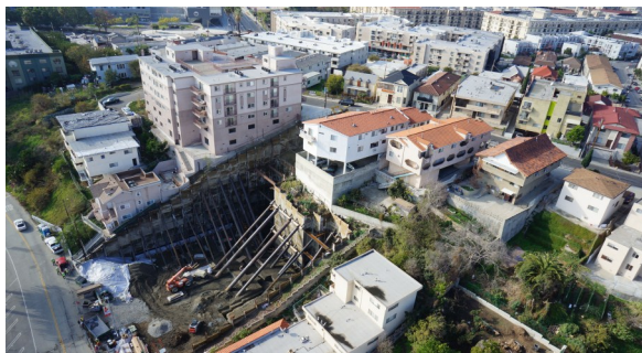
Aerial photos taken January 2012