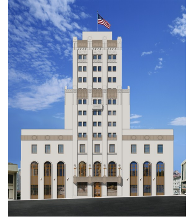
Connections Housing circa 2012: renovations will restore the building colors to the original concrete grey

On January 26th leaders from both the private and public sector gathered to celebrate the groundbreaking of Connections Housing, the first one stop permanent homeless shelter in San Diego County. The creation of Connections Housing is a large effort of numerous organizations including Affirmed Housing Group, PATH, PATH Ventures, Family Health Care Centers of San Diego, Centre City Development Corporation, San Diego Housing Commission, US Bank, Enterprise Community Investment, CSH and many more. Speakers included Mayor Jerry Sanders, Councilmembers Kevin Faulconer and Todd Gloria. Everyone praised the new concept and is anxious for the doors to open for the underserved homeless population. Completion is scheduled for December of this year. For more information please go to www.sdconnections.org