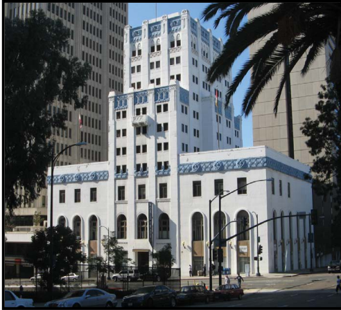
Connections Housing is a collaborative effort of: Affirmed Housing, Path Partners, and Family Housing Centers of San Diego,